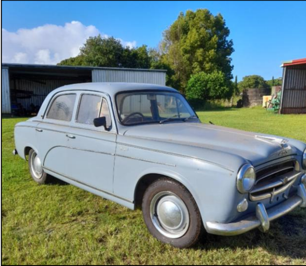
1958 Peugeot Sedan 403