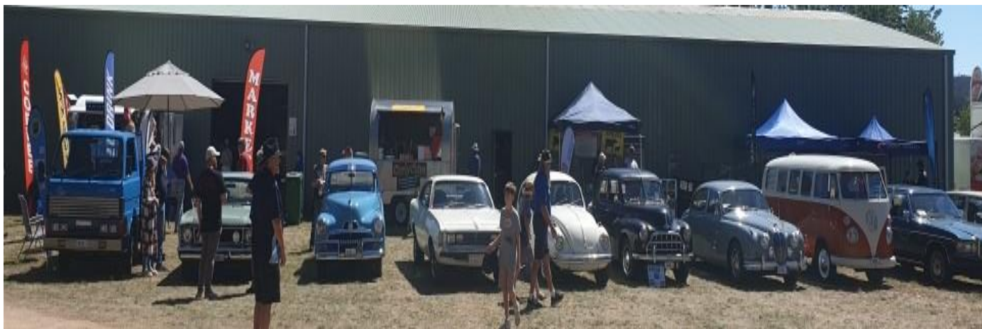
Bega Heritage Motor Club at the Nimmitabel Show

Our aim: TO ENCOURAGE THE PRESERVATION, RESTORATION & USE OF OUR MOTORING HERITAGE