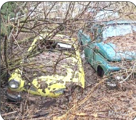
The owner plans to restore. Someday. Would consider selling: $500K

Technology Center, located at 2811 Merrill Field Dr.