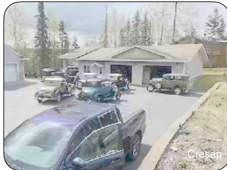
Tom and Marcy Cresap's wood shop and car repair bay.