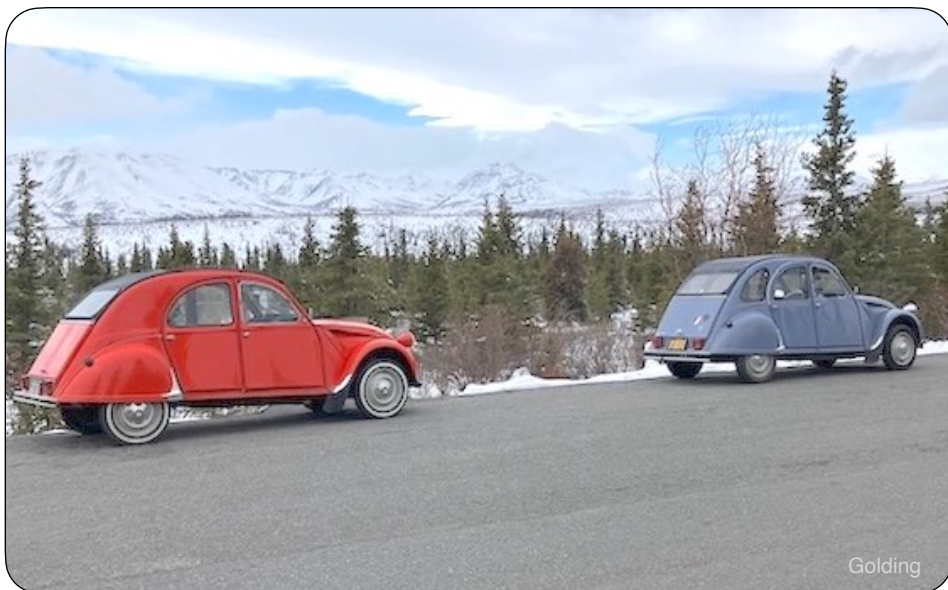
The two Citroën 2-CV's pulled over in the queue provided by suddenly clearing skies in order to view clearing mountains, including Denali.