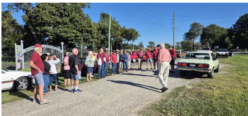
Group briefing from El Presidente before hitting the road!