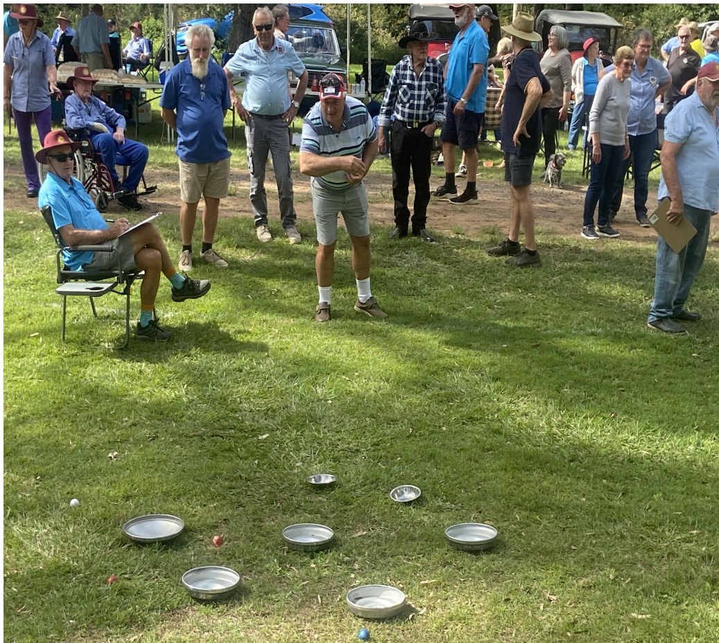
One of the games we had throw the Golf ball into a Hub Cap its harder then you think