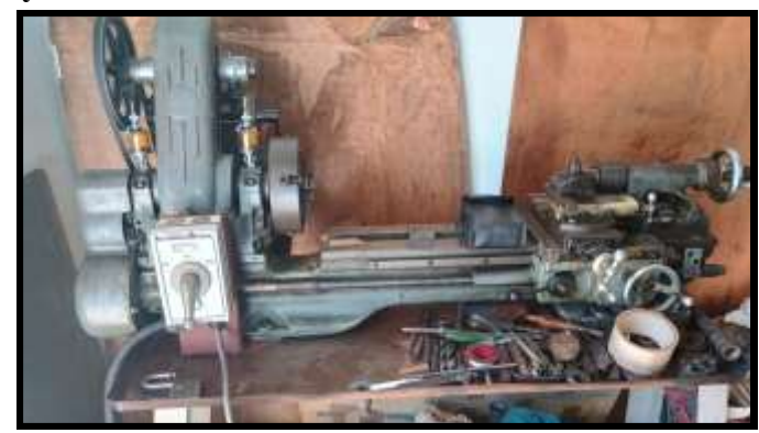
Myford Super 7 lathe with lots of cutting tools. On its own stand. $700, pickup only.