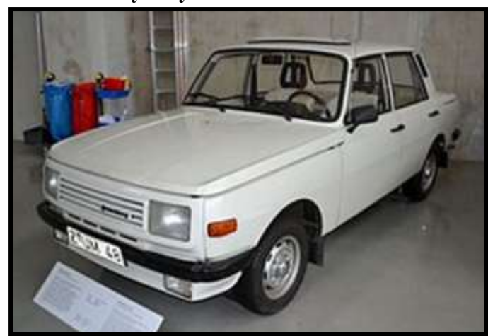
Terry Somerville (Wikipedia)