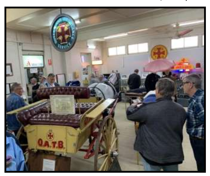
The visit brought back a lot of memories for Ern, who spent 41 years in the Ambulance Service. All in all, it was a fantastic outing!