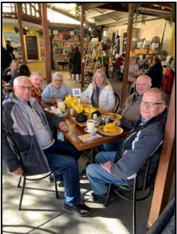
It was a fantastic weekend!