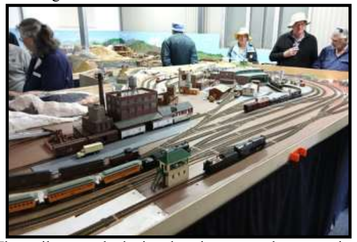
The rail setup had signal points, so when a train passed over them it would be switched to another track.

Plenty of engines were set up around the display, with two steam locomotives pulling carriages and a diesel pulling freight along the tracks through the countryside, where a storm raged with thunder and lightning. The trains crossed bridges, passed a mining camp, ran through a tunnel and into a freight yard complete with a working turntable.