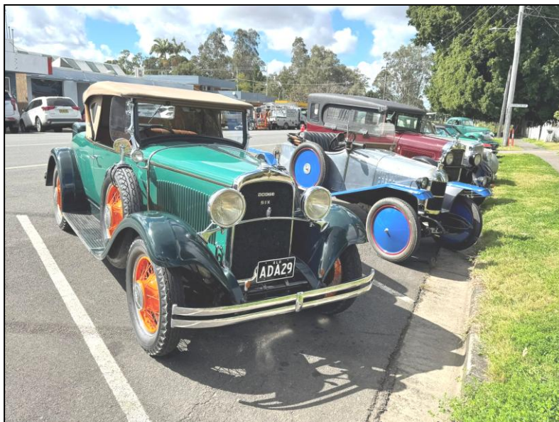
NRVVCC Rally Lismore