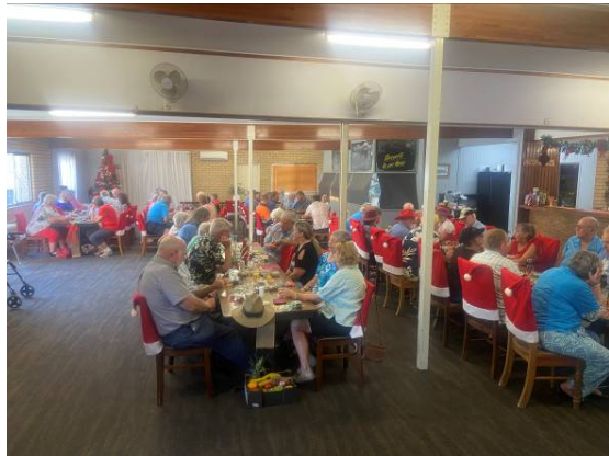
Great Meal at the Tenthill Pub